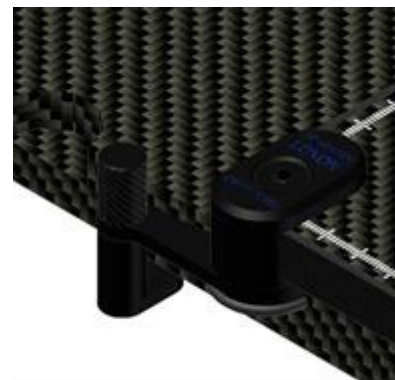
LOXON™ moving part