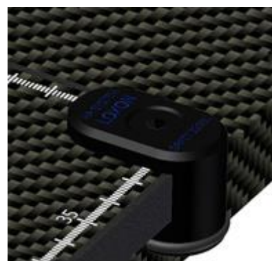
LOXON™ fixed part

The two parts of LOXON™ are mounted on the Orfit Industries base plate with the M6 x 12 screws supplied in the package. Always mount the fixation devices on the base plate before installing the base plate on the couch.