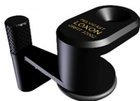
LOXON moving part