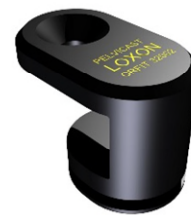
LOXON fixed part

The two parts of LOXON are mounted on the Orfit Industries base plate with the M6 x 12 screws supplied in the package.