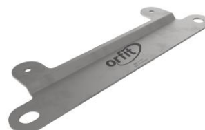
Article No. : 35747/6