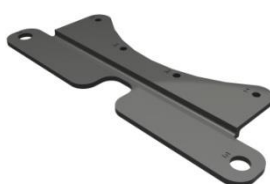
Article No. : 32063