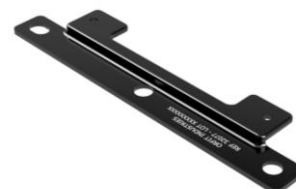
Article No. : 32077