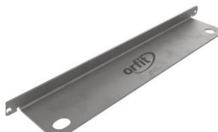
Article No. : 35747/4