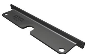
Article No. : 35747/8