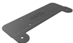
Article No. : 35747