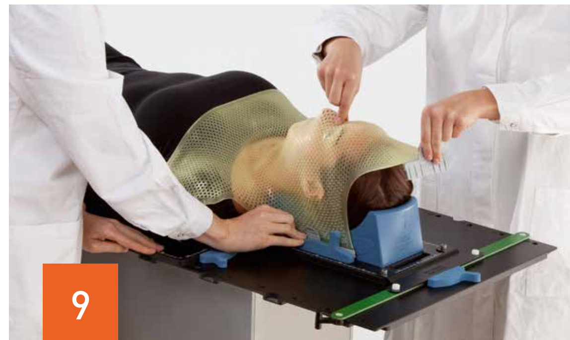
9 Hold the material at the nose and stretch the cranial flap. Secure the L-shaped profile in the base plate.