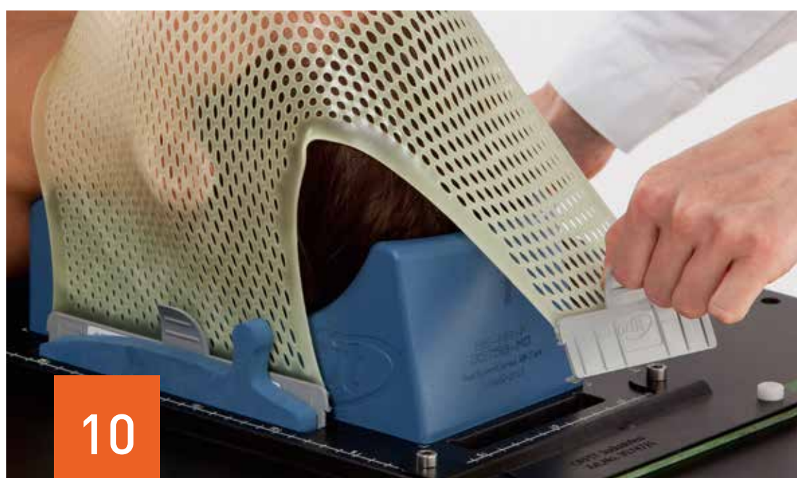
10 To secure the profile, slide the L-shaped profile into the slot.