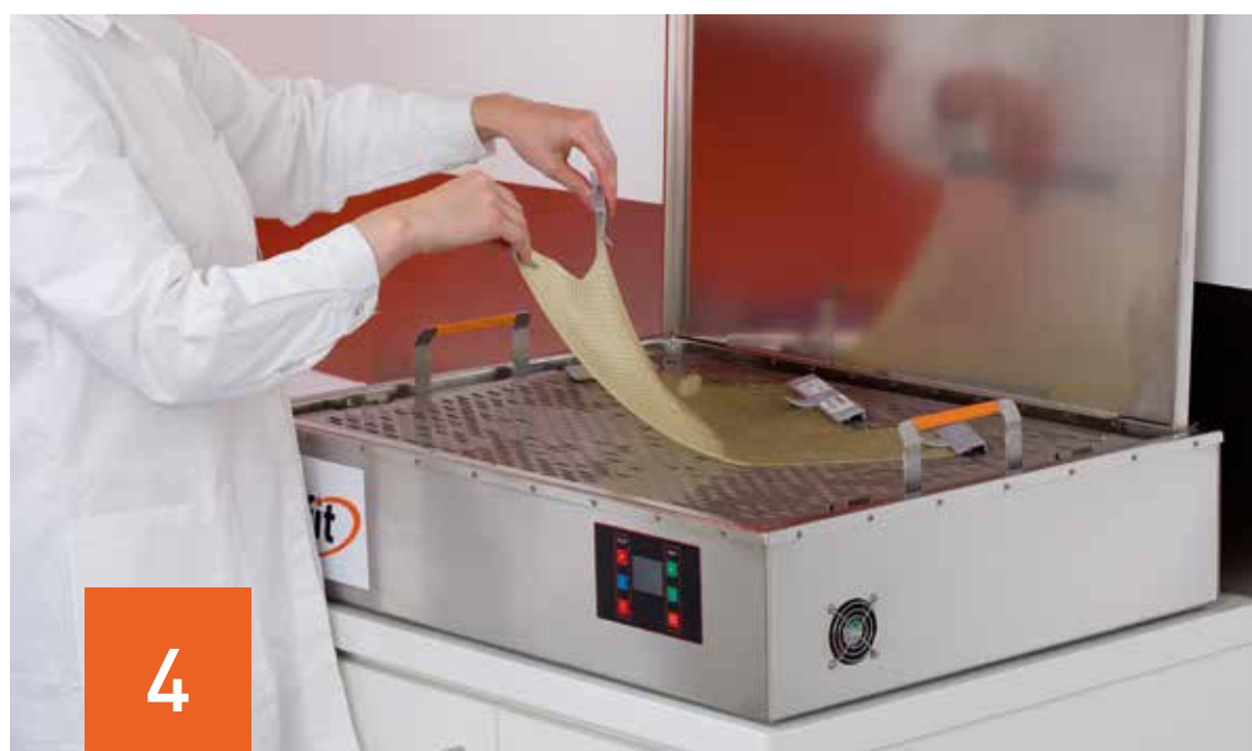
4 Remove the precut mask from the water bath.