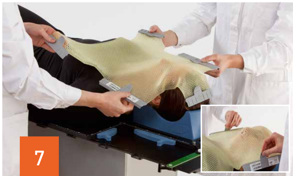
7 Position the precut over the face of the patient with the top of the nose hole on the tip of the nose.