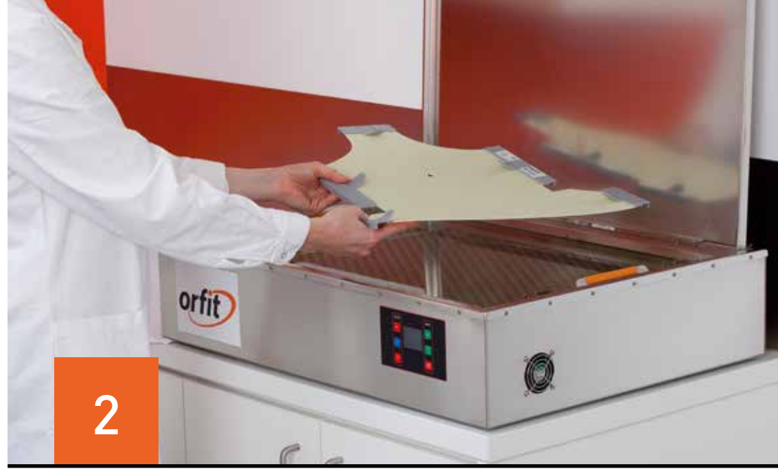
2 Place the precut mask in the hot water.