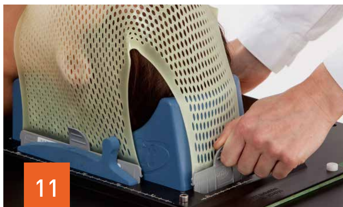
11 Push the L-shaped profile all the way into the slot.