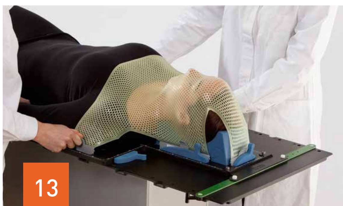
13 Insert the shoulder profiles in the base plate and mold the mask around the shoulders and in the neck area. Make sure that the mask covers the chest area sufficiently.