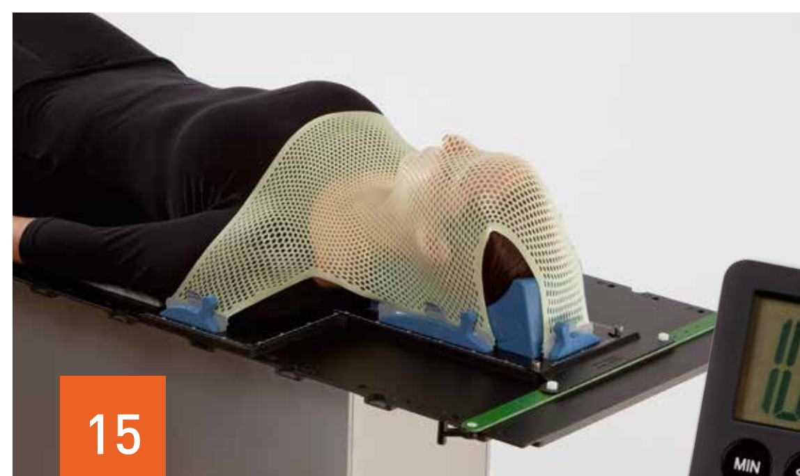
15 Leave the mask to cool on the patient for at least 10 minutes. Only then the mask may be removed.