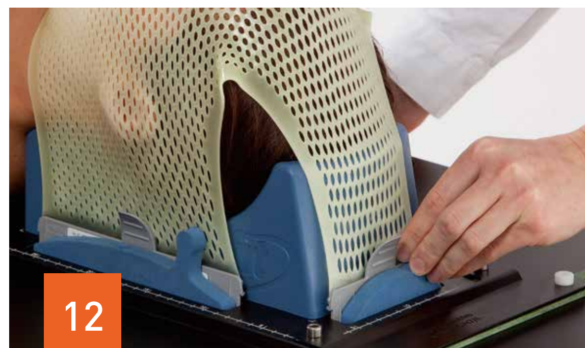
12 Secure the L-shaped profile in the slot with a foam handle of the appropriate length.