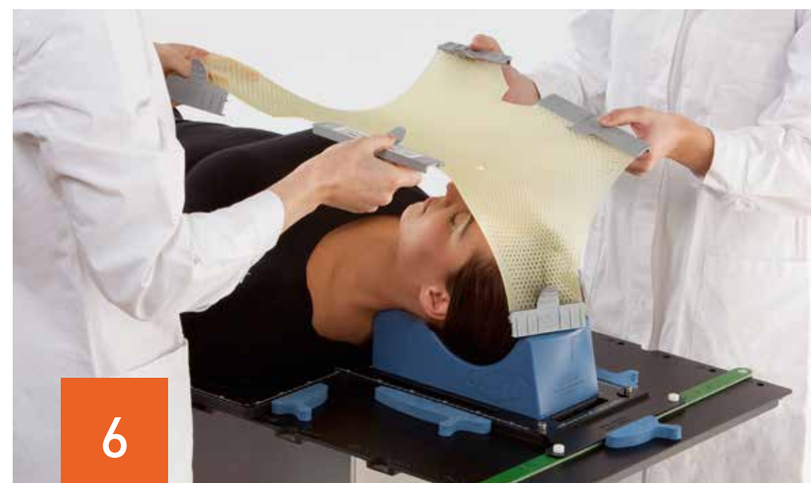
6 Pre-stretch the mask slightly before positioning it on the patient.