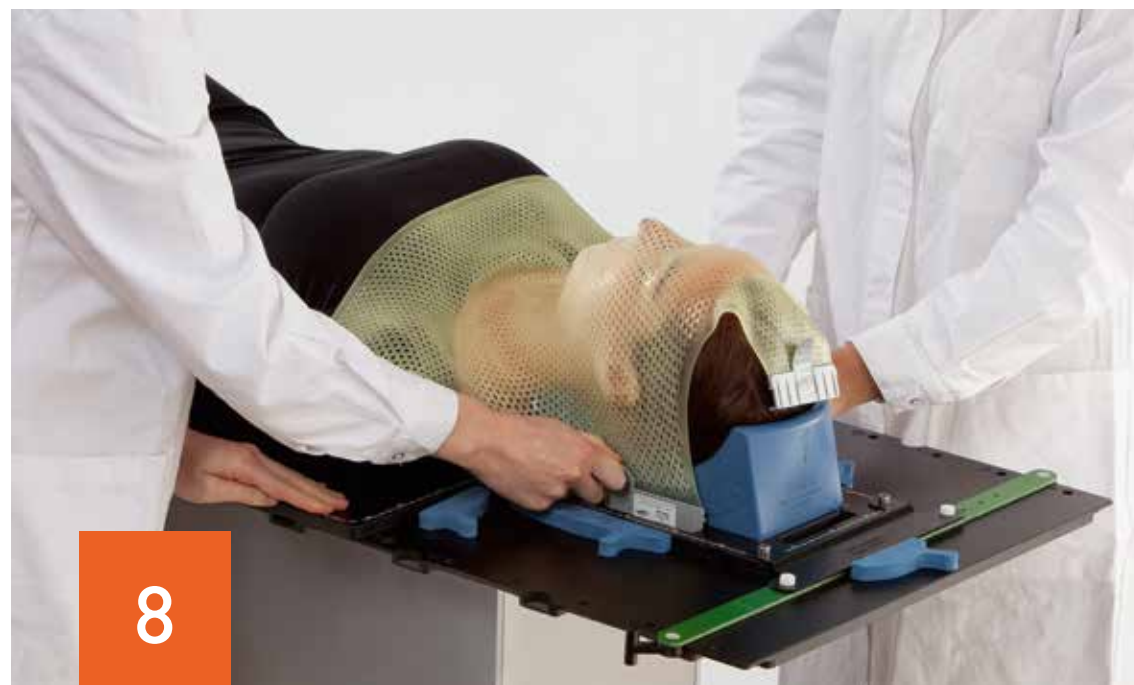
8 Attach the lateral profiles to the base plate with the foam handles.