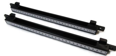
32145/5 (left) and 32145/6 (right)

HP Breast Board Adapters allow the attachment of 2-points breast masks to the board. The adapters should be screwed in to the board at the level of the grid. Both adapters have a millimeter scale running from 0 to 30mm. The position 0 mm should be facing the cranial side of the board.