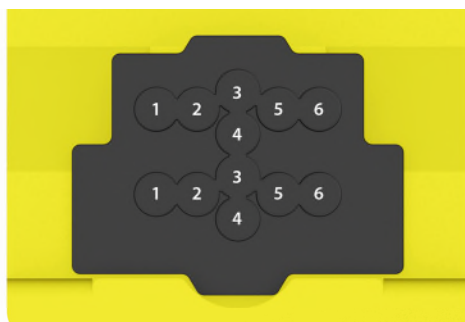
PLATE in six different positions, depending on the position and size of the patient. The six positions are indicated by the numbers 1 to 6 on the plate.

The PRONE HEAD SUPPORT can be placed on the POSITIONING