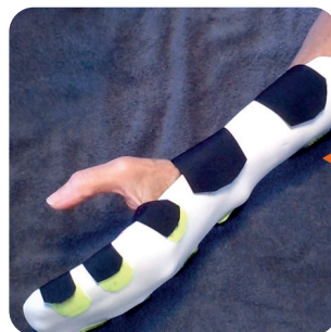
Dorsal Blocking Orthosis for Flexor Tendon Repair